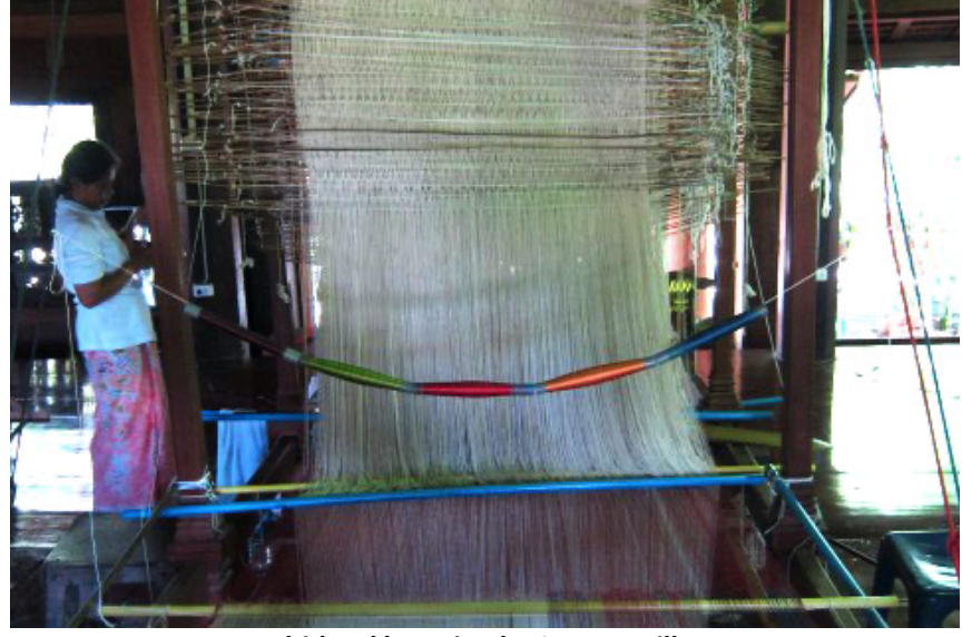
Multi-level loom in Tha Sawang Village